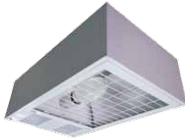
LB with WireGuard