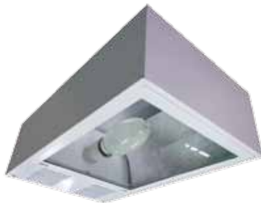
LB with Tempered Glass

Recommended for mounting heights below 20ft and best suited for long period of use as they have a "restrike" period after being switched off.